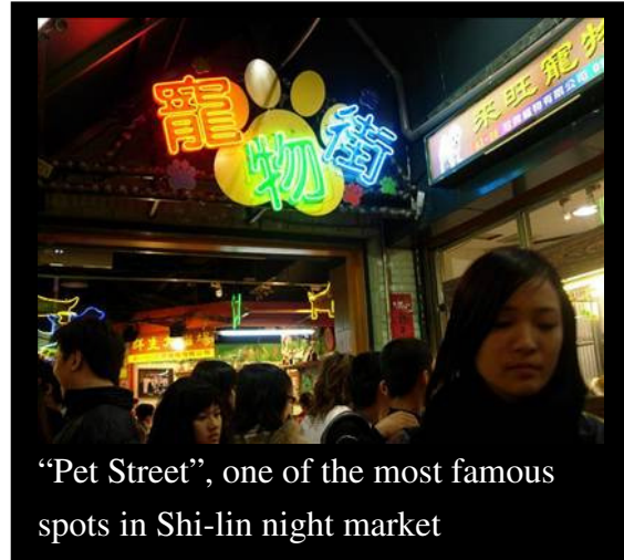
“Pet Street”, one of the most famous spots in Shi-lin night market